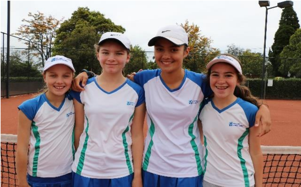
1. Runners up in AJL final, the 12A Girls team.