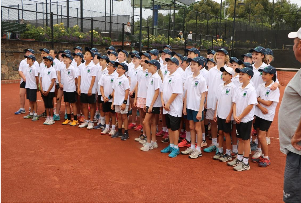
3. Group Photo at Alicia Molik Cup, December 2018

We are currently in advance stages of preparation for the Alicia Molik Cup in December, to be followed closely by the Daphne Fancutt in January and the Pat Cash in February.