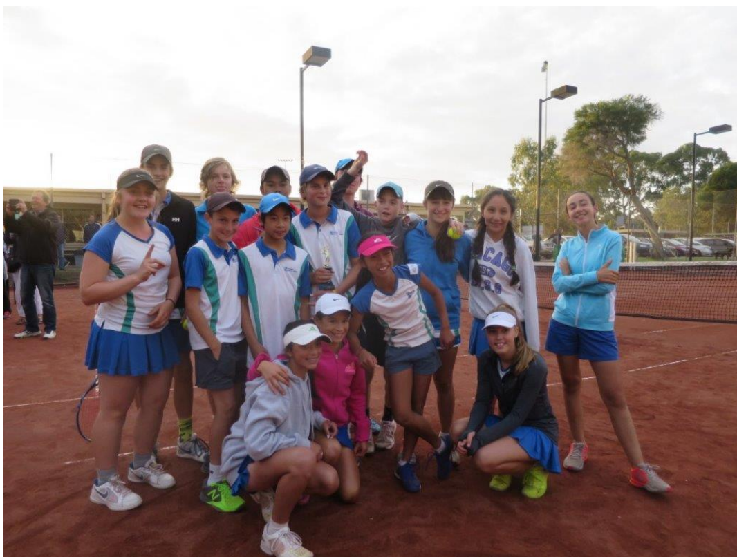
Until we meet again