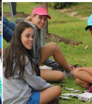
Figure 3 Pat Pearce Shield 2018