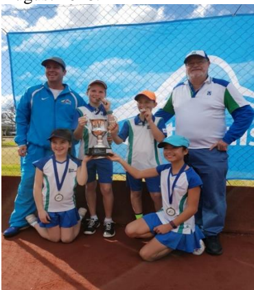
Figure 1 Sedgman Cup Team